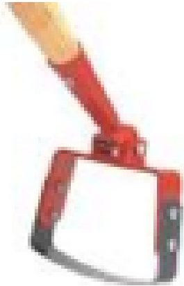
5" Stirrup Hoe