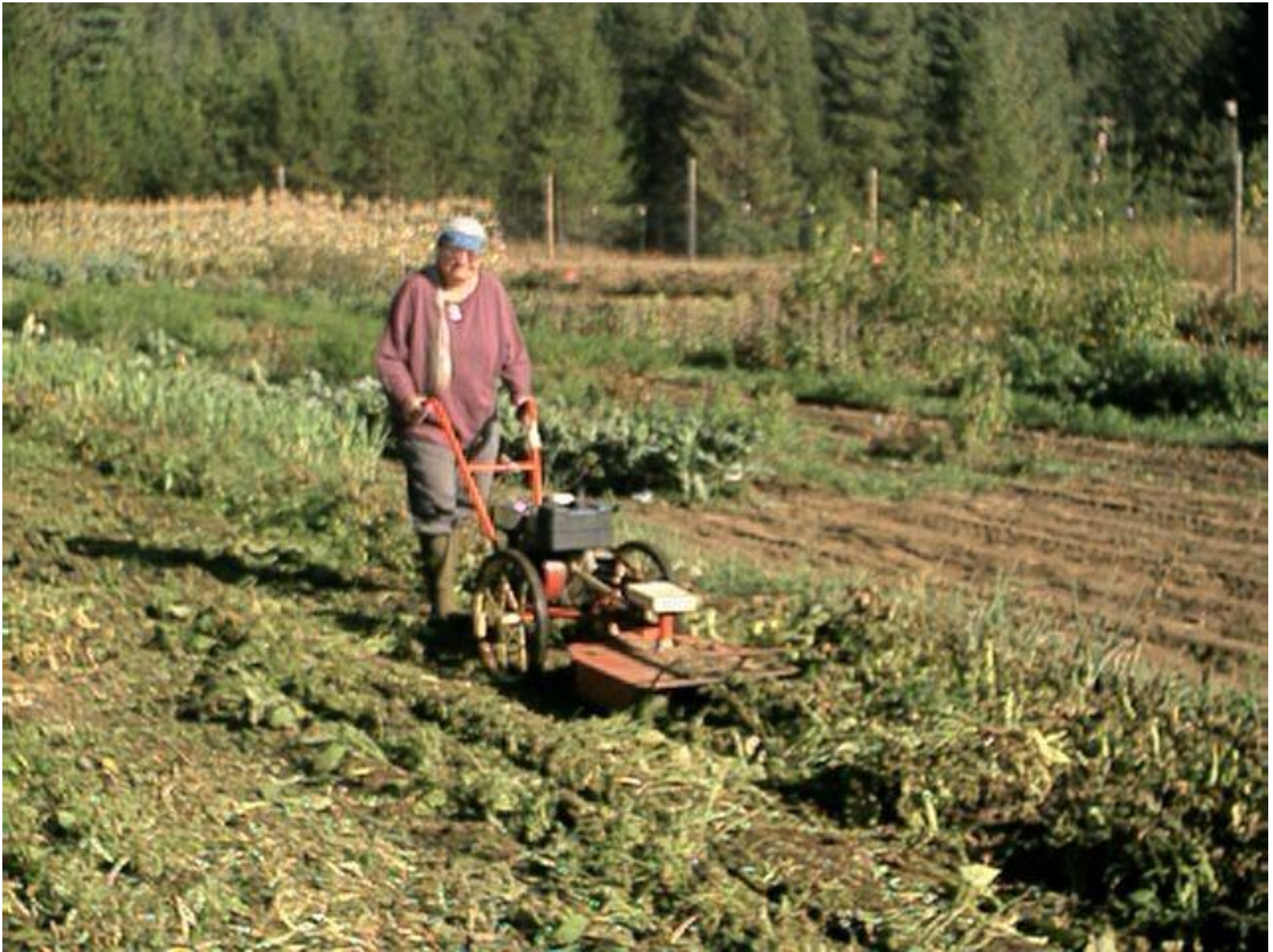
DR Brush mower purchased used $300 Greentree Naturals Tools of the Trade