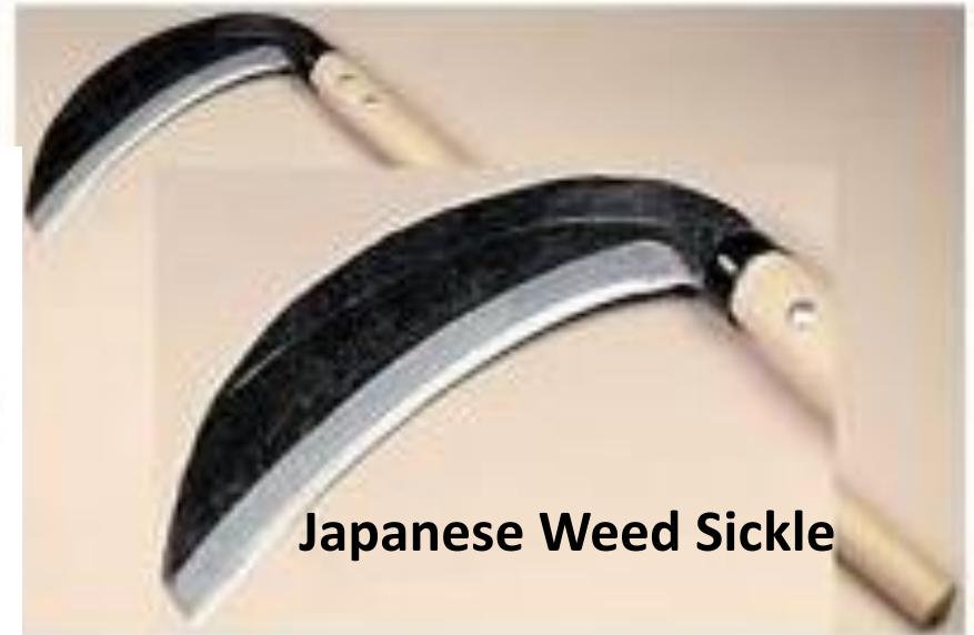
Japanese Weed Sickle