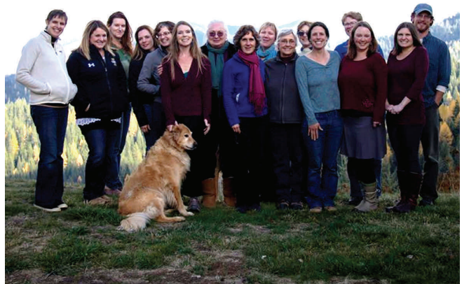
The statewide Cultivating Success™ collaborative team of UI Extension educators, farmer mentors and nonprofit partners.

Our team included ten University of Idaho Extension educators, two program coordinators, six farmers, and two nonprofit professionals from Cultivating Success™ partner Rural Roots and the Inland Northwest Food Network.